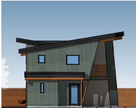
LH SIDE ELEVATION