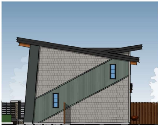
RH SIDE ELEVATION