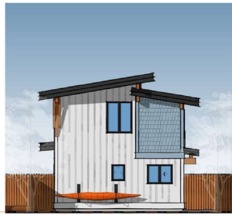
REAR ELEVATION 3/16" = 1'-0"