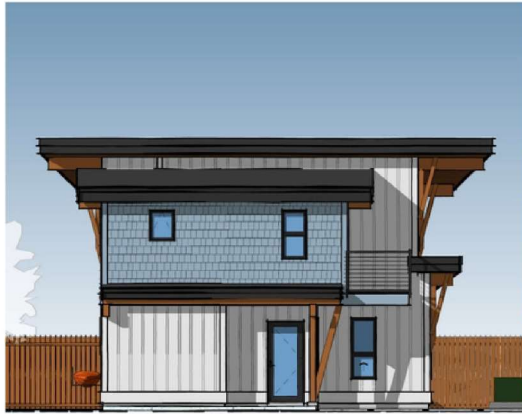
LH SIDE ELEVATION 3/16" = 1'-0"