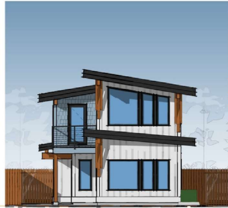
FRONT ELEVATION 3/16" = 1'-0"