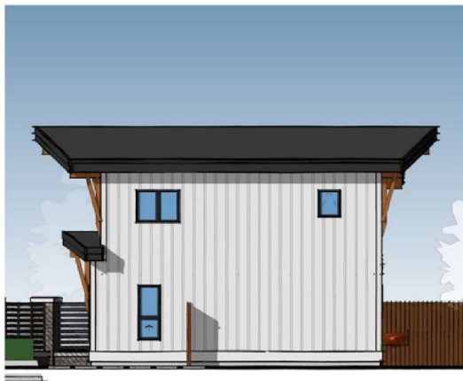
RH SIDE ELEVATION 3/16" = 1'-0"