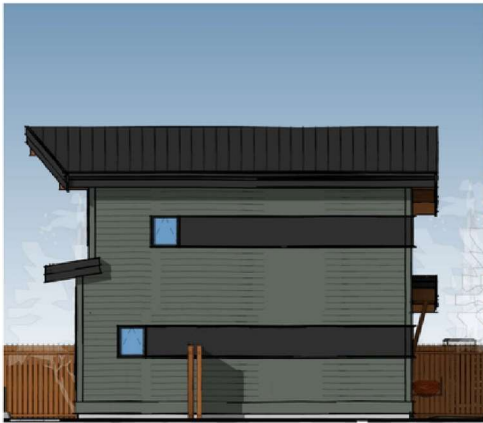
RH SIDE ELEVATION 3/16" = 1'-0"