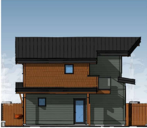
LH SIDE ELEVATION 3/16" = 1'-0"